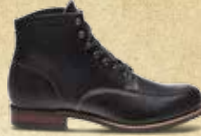
COURTLAND W00279 BLACK