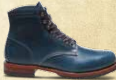
EVANS W40050 NAVY