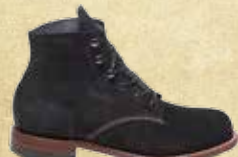
ORIGINAL 1000 MILE W40074 BLACK SUEDE (WOMEN'S)