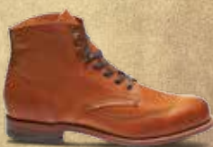
ADDISON W05343 TAN