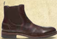
MONTAGUE W05452 BROWN