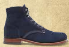
ORIGINAL 1000 MILE W40092 NAVY SUEDE