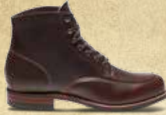
COURTLAND W00278 BROWN