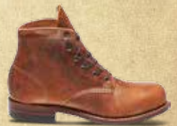
ORIGINAL 1000 MILE W40073 GOLD (WOMEN'S)