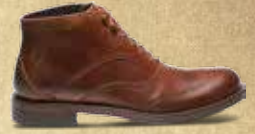
WESLEY W00924 TAN