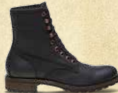
HARTMANN W00916 BLACK