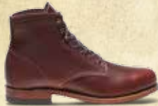
ORIGINAL 1000 MILE W05299 RUST