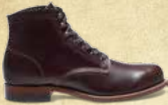
ORIGINAL 1000 MILE W00137 CORDOVAN