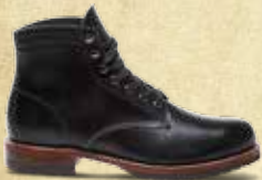
EVANS W40048 BLACK