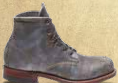
ORIGINAL 1000 MILE W40076 SILVER GREY (WOMEN'S)