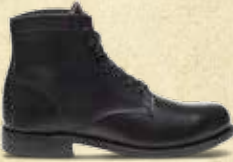
ORIGINAL 1000 MILE W08803 BLACK