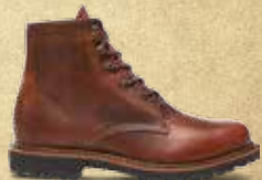
DUVALL W40041 BROWN