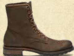
HARTMANN W00920 OLIVE