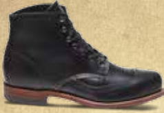
ADDISON W05344 BLACK