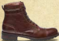
MONTGOMERY W05311 BROWN