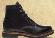
DUVALL W40042 BLACK