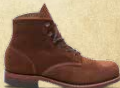
ORIGINAL 1000 MILE W40075 BROWN SUEDE (WOMEN'S)