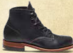
ORIGINAL 1000 MILE W05455 BLACK (WOMEN'S)