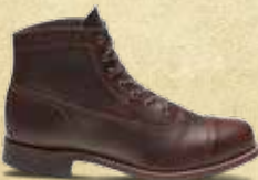
ROCKFORD W05293 BROWN