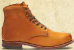
ORIGINAL 1000 MILE W05848 TAN