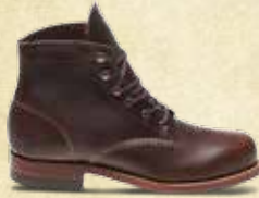
ORIGINAL 1000 MILE W05454 BROWN (WOMEN'S)