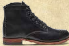
ORIGINAL 1000 MILE W05300 BLACK