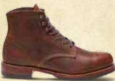
EVANS W40049 BROWN