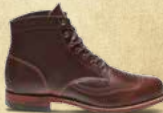
ADDISON W05342 BROWN