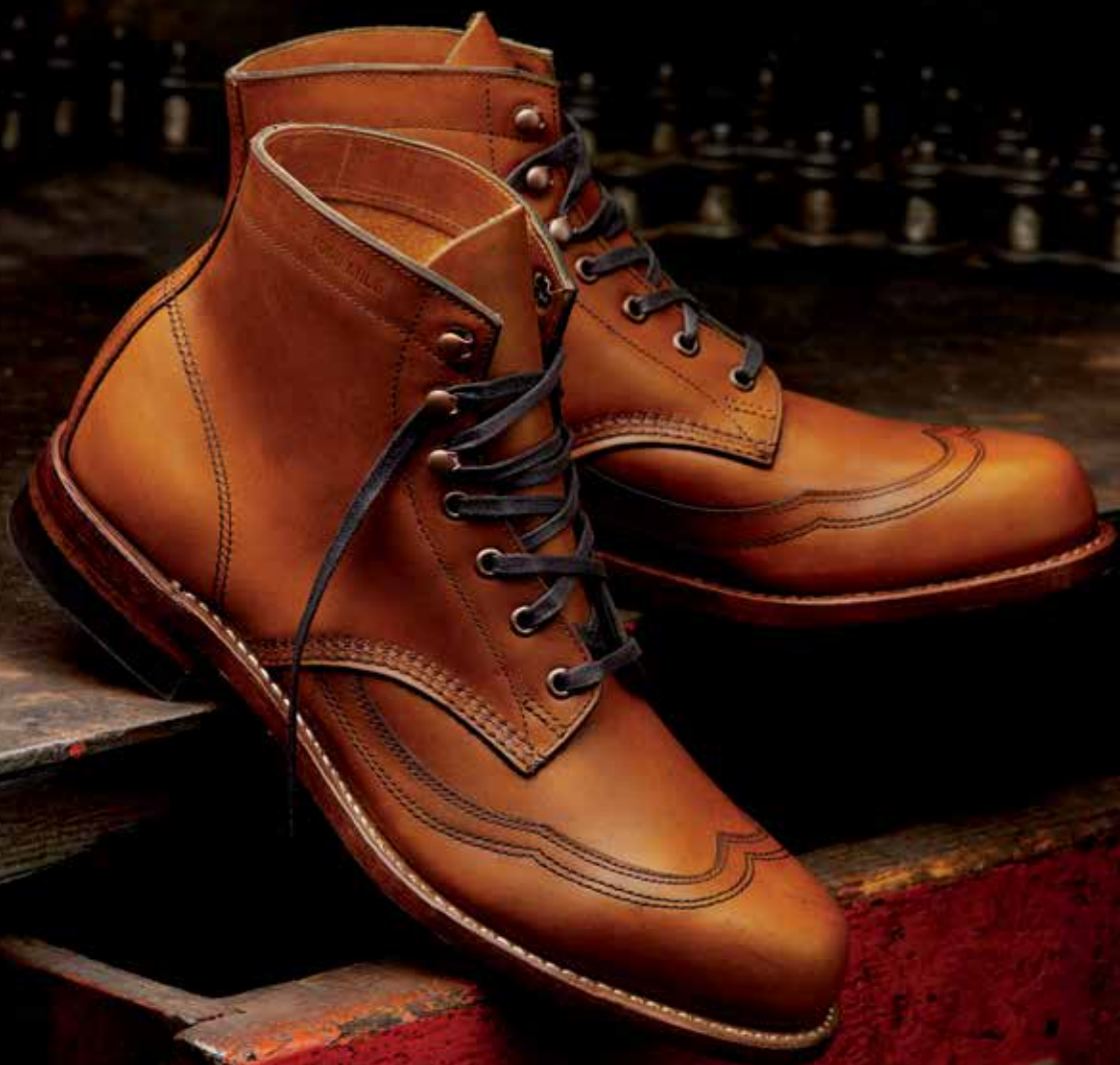
ADDISON W05343 TAN