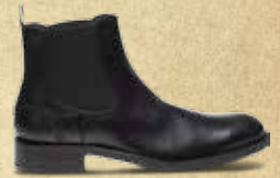
MONTAGUE W00502 BLACK