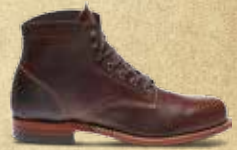
ORIGINAL 1000 MILE W05301 BROWN