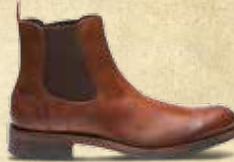
MONTAGUE W00922 TAN