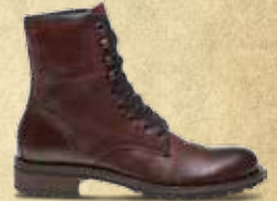
HARTMANN W00607 BROWN