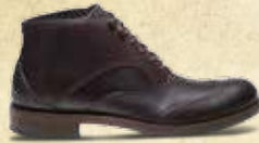
WESLEY W05366 BROWN