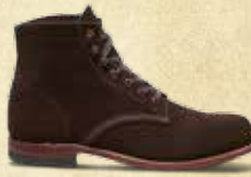
ORIGINAL 1000 MILE W40093 BROWN SUEDE