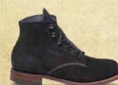
ORIGINAL 1000 MILE W40074 BLACK SUEDE (WOMEN'S)