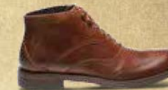
WESLEY W00924 TAN