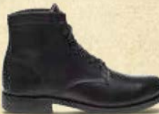
ORIGINAL 1000 MILE W08803 BLACK