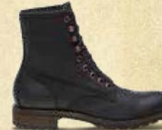
HARTMANN W00916 BLACK