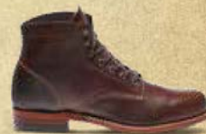
ORIGINAL 1000 MILE W05301 BROWN