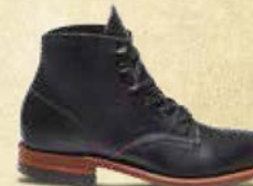
ORIGINAL 1000 MILE W05455 BLACK (WOMEN'S)