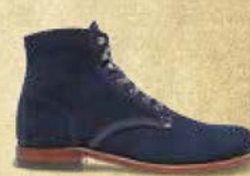
ORIGINAL 1000 MILE W40092 NAVY SUEDE