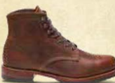
EVANS W40049 BROWN