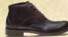
WESLEY W05366 BROWN