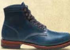
EVANS W40050 NAVY