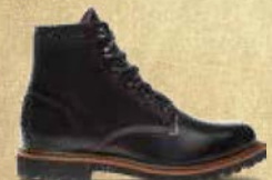
DUVALL W40042 BLACK