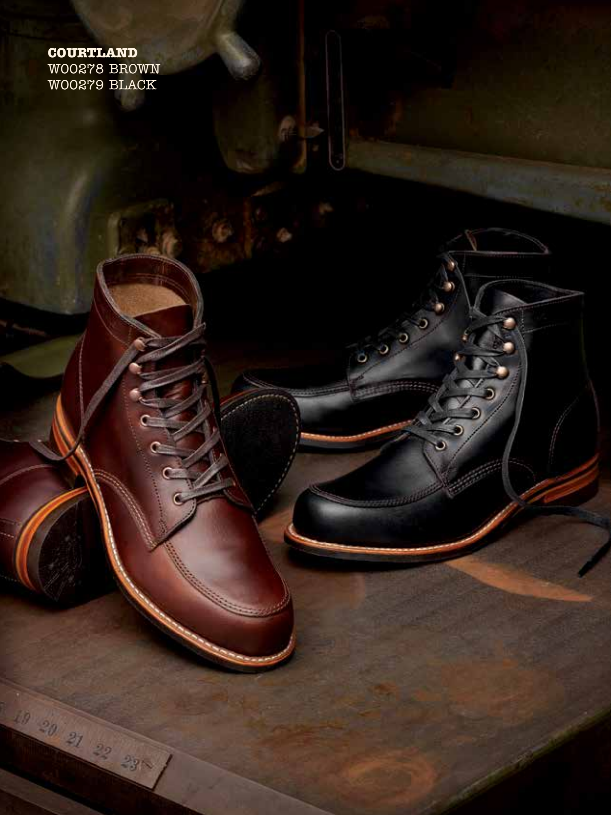
COURTLAND W00278 BROWN W00279 BLACK