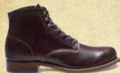
ORIGINAL 1000 MILE W00137 CORDOVAN