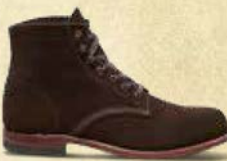
ORIGINAL 1000 MILE W40093 BROWN SUEDE