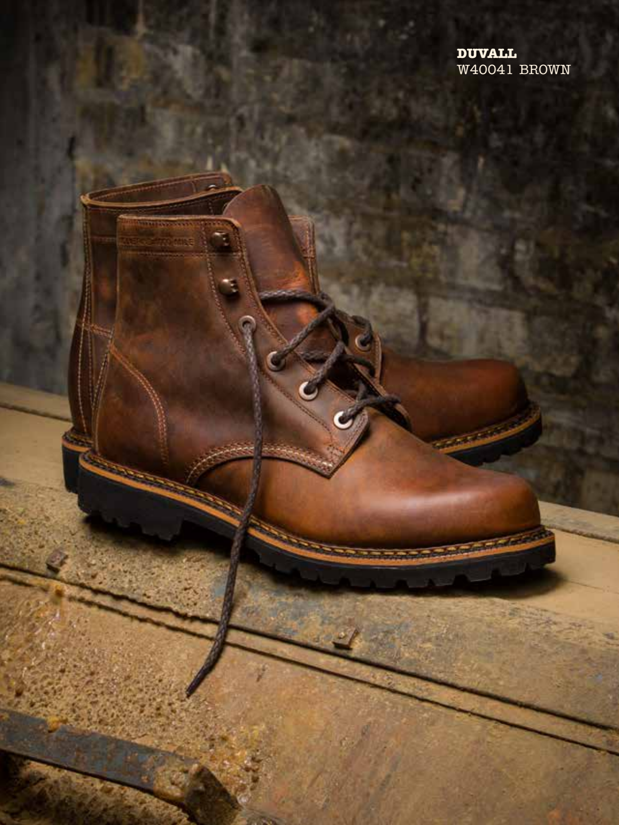
DUVALL W40041 BROWN