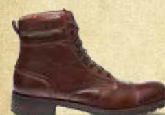
MONTGOMERY W05311 BROWN