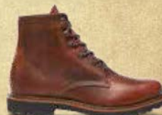
DUVALL W40041 BROWN