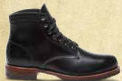
EVANS W40048 BLACK