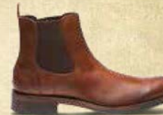
MONTAGUE W00922 TAN