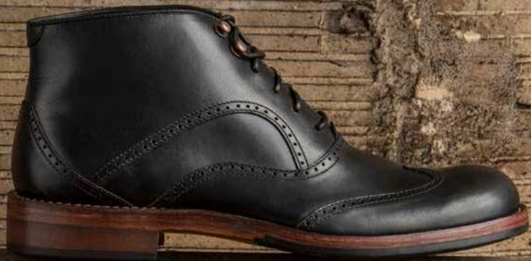
WESLEY W00923 BLACK