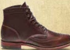
ADDISON W05342 BROWN