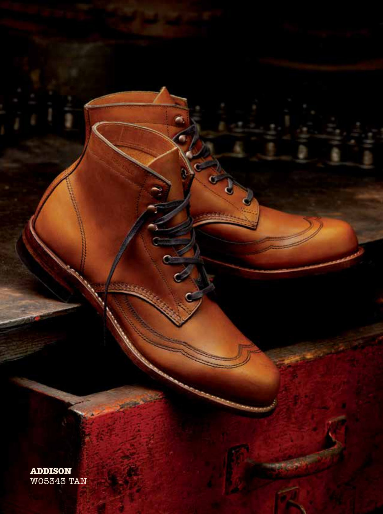
ADDISON W05343 TAN