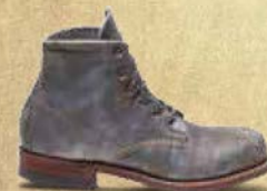
ORIGINAL 1000 MILE W40076 SILVER GREY (WOMEN'S)