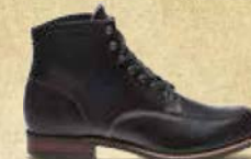
COURTLAND W00279 BLACK