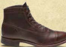
ROCKFORD W05293 BROWN