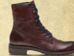
HARTMANN W00607 BROWN