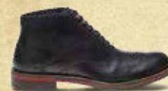
WESLEY W00923 BLACK