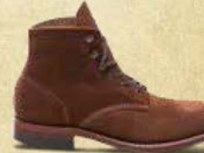
ORIGINAL 1000 MILE W40075 BROWN SUEDE (WOMEN'S)