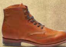
ADDISON W05343 TAN