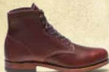
ORIGINAL 1000 MILE W05299 RUST