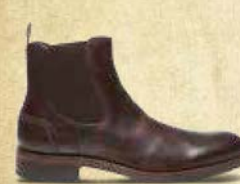
MONTAGUE W05452 BROWN