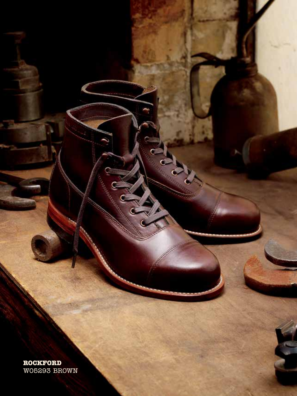
ROCKFORD W05293 BROWN