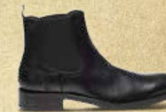
MONTAGUE W00502 BLACK