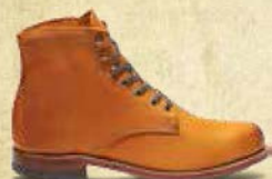
ORIGINAL 1000 MILE W05848 TAN