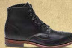
ADDISON W05344 BLACK