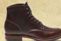
COURTLAND W00278 BROWN