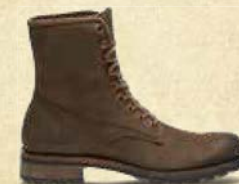
HARTMANN W00920 OLIVE