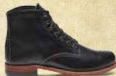
ORIGINAL 1000 MILE W05300 BLACK