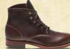
ORIGINAL 1000 MILE W05454 BROWN (WOMEN'S)