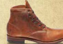
ORIGINAL 1000 MILE W40073 GOLD (WOMEN'S)